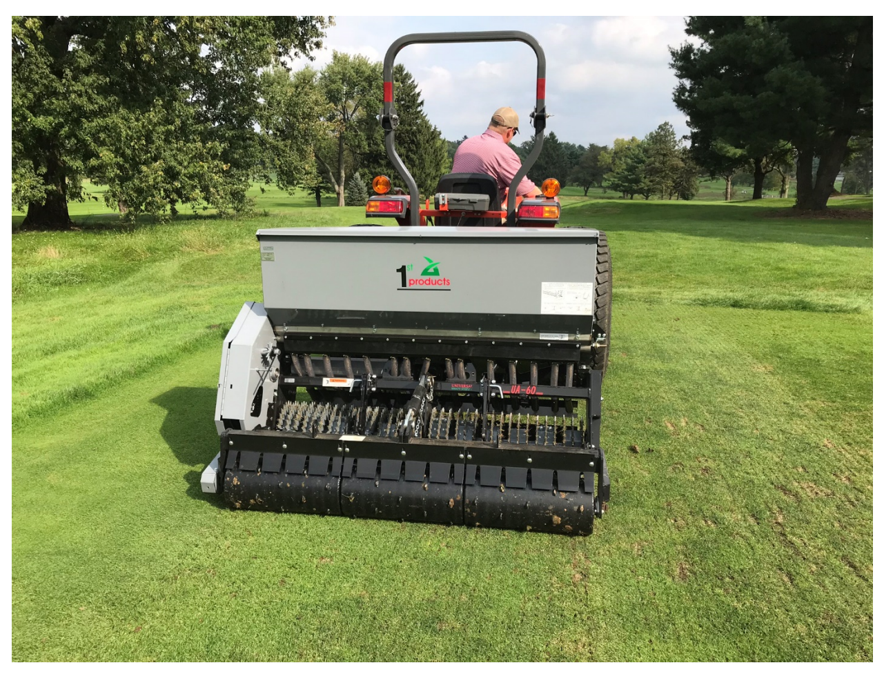
Figure 9. Cultivation achieves important agronomic goals that include relief of soil compaction, thatch/organic matter reduction, and improved water and air exchange