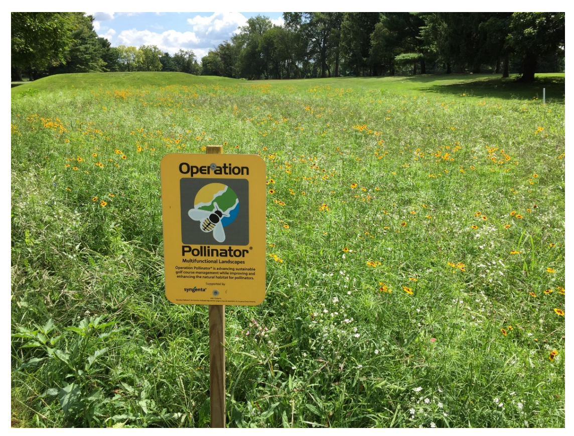
Figure 14. Golf courses can provide significant pollinator habitat in out of play areas.