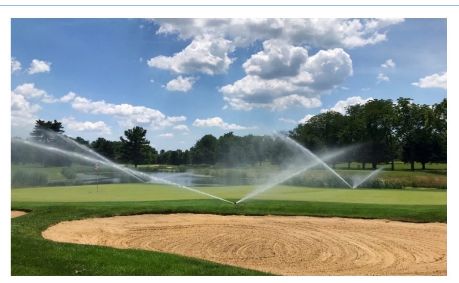
Figure 7. Irrigating greens and fairways.