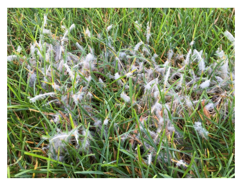
Figure 12. An IPM approach can help superintendents deal with disease outbreaks when they occur.