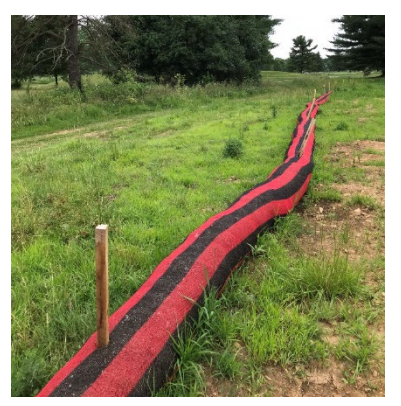
Figure 1. Erosion and sediment control is a critical aspect of all construction activities when soil is disturbed.