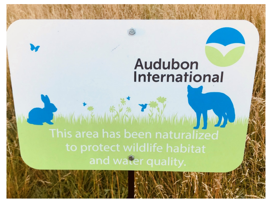
Figure 4. Audubon International certification can provide recognition for environmental education and natural resource protection efforts.