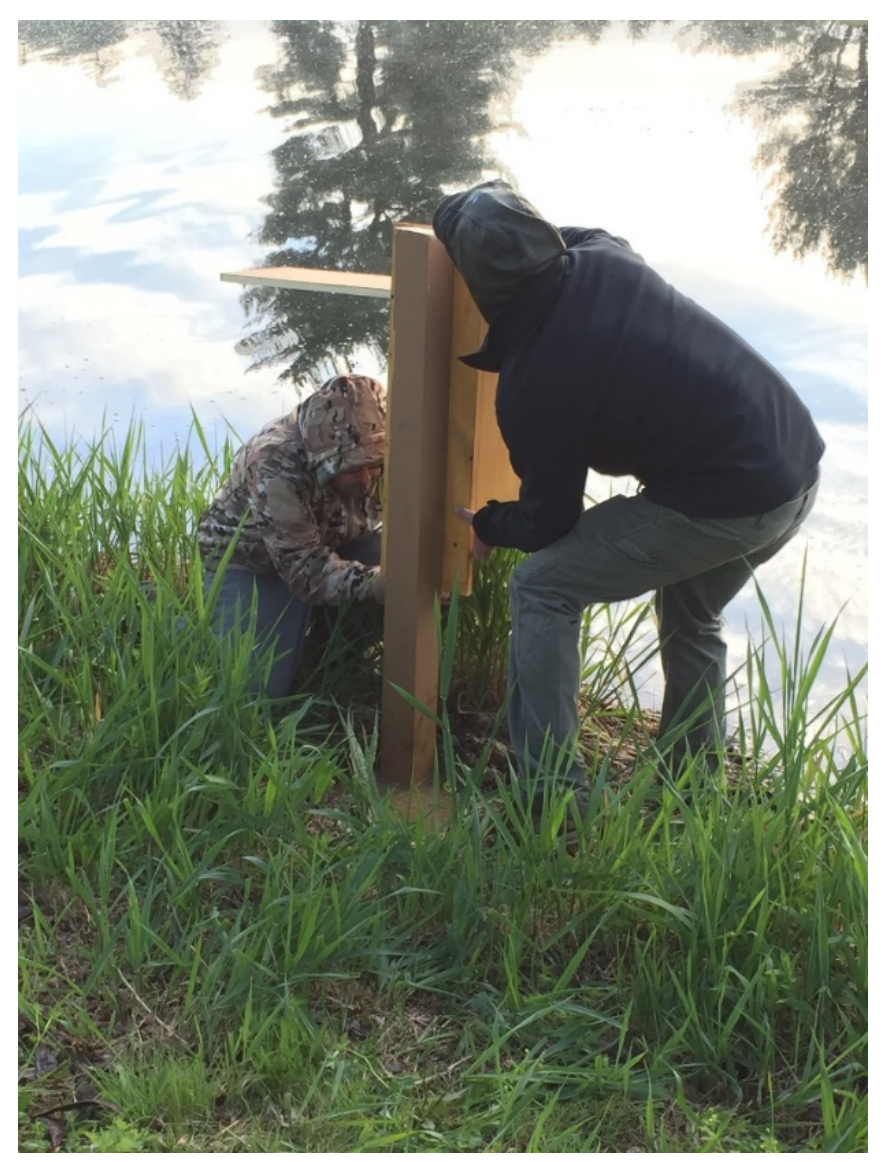
Figure 3. Installing a duck nesting box.

Retain riparian buffers along waterways to protect water quality, provide food, nesting sites, and cover for wildlife.