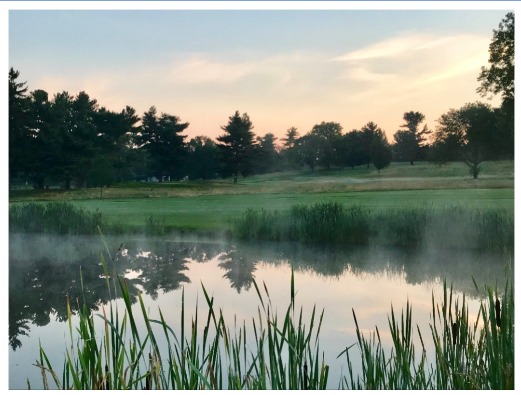
Figure 5. BMPs protect the water quality of surface waters.