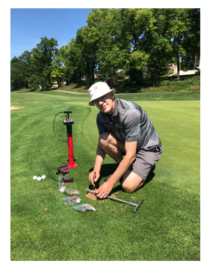
Figure 8. Accurate and consistent soil sampling provides useful information to predict plant response to applied nutrients.