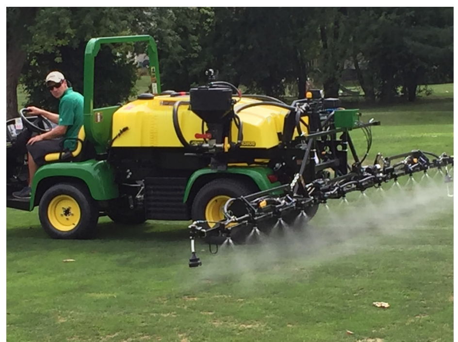
Figure 13. Best management practices help to ensure that pesticides don't migrate off target.