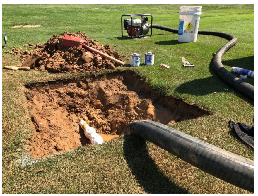
Figure 6. Irrigation system maintenance.