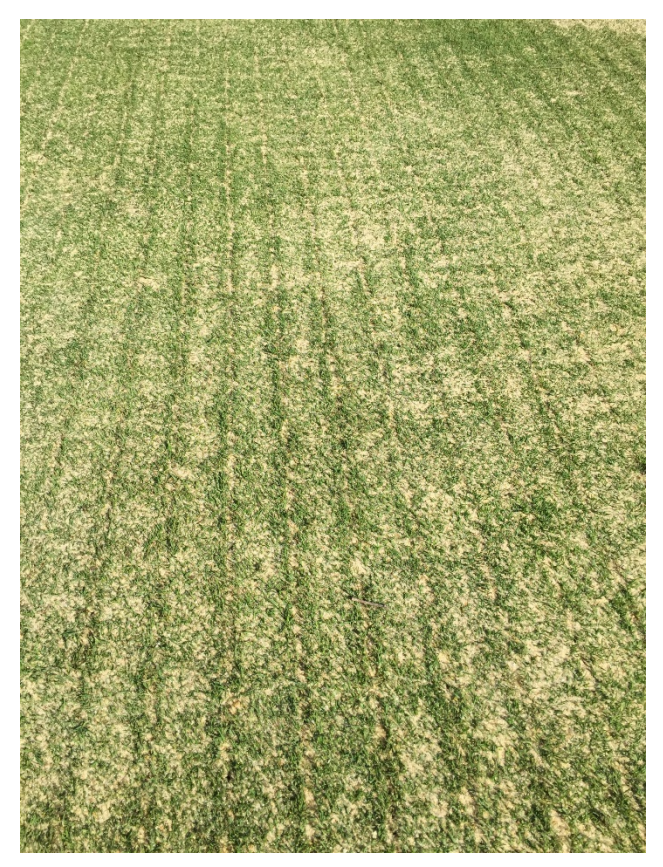
Figure 10. Topdressing dilutes organic matter and improves soil structure.

• Light, frequent applications of topdressing sand on putting greens can smooth out minor surface irregularities, aiding in the management of thatch accumulation.