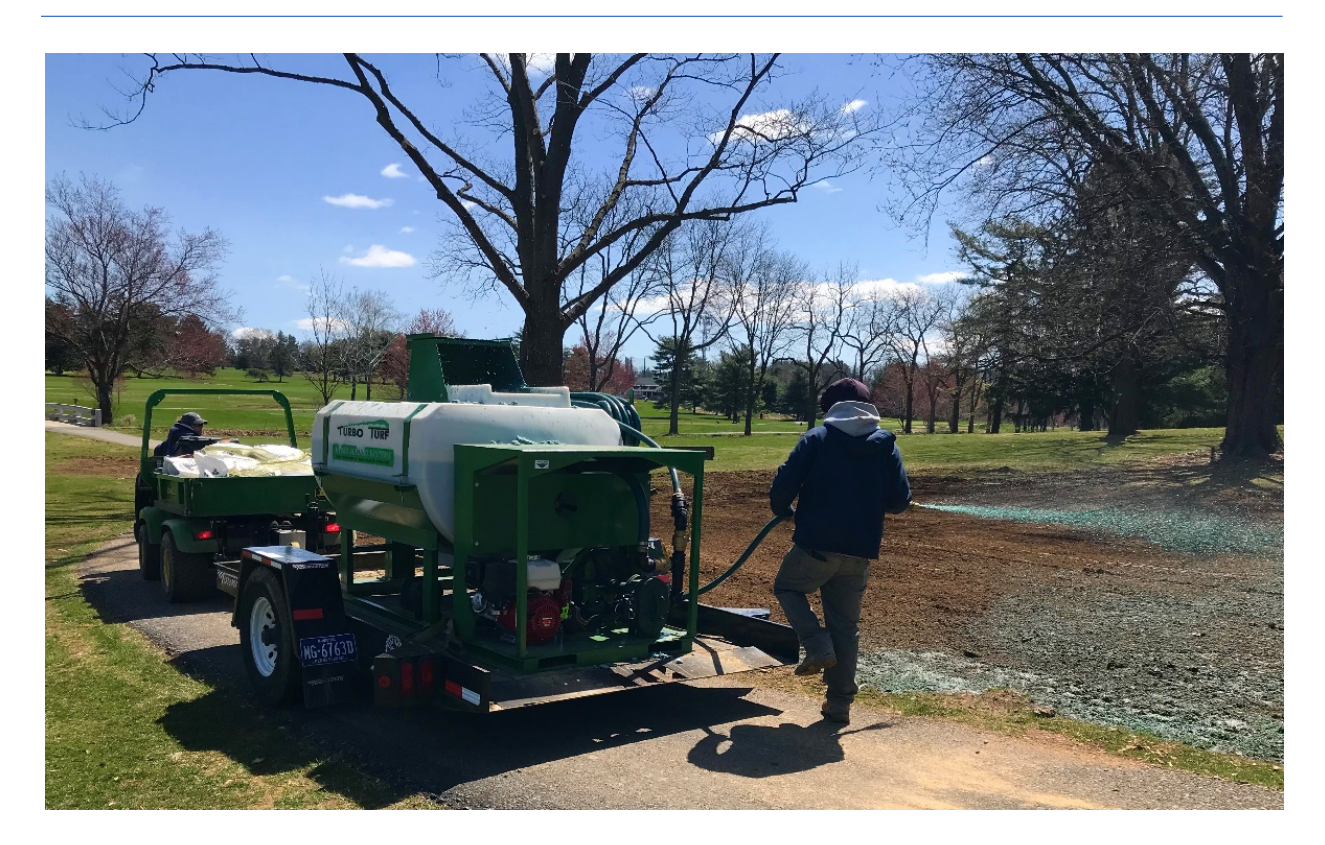
Figure 2. Hydroseeding.