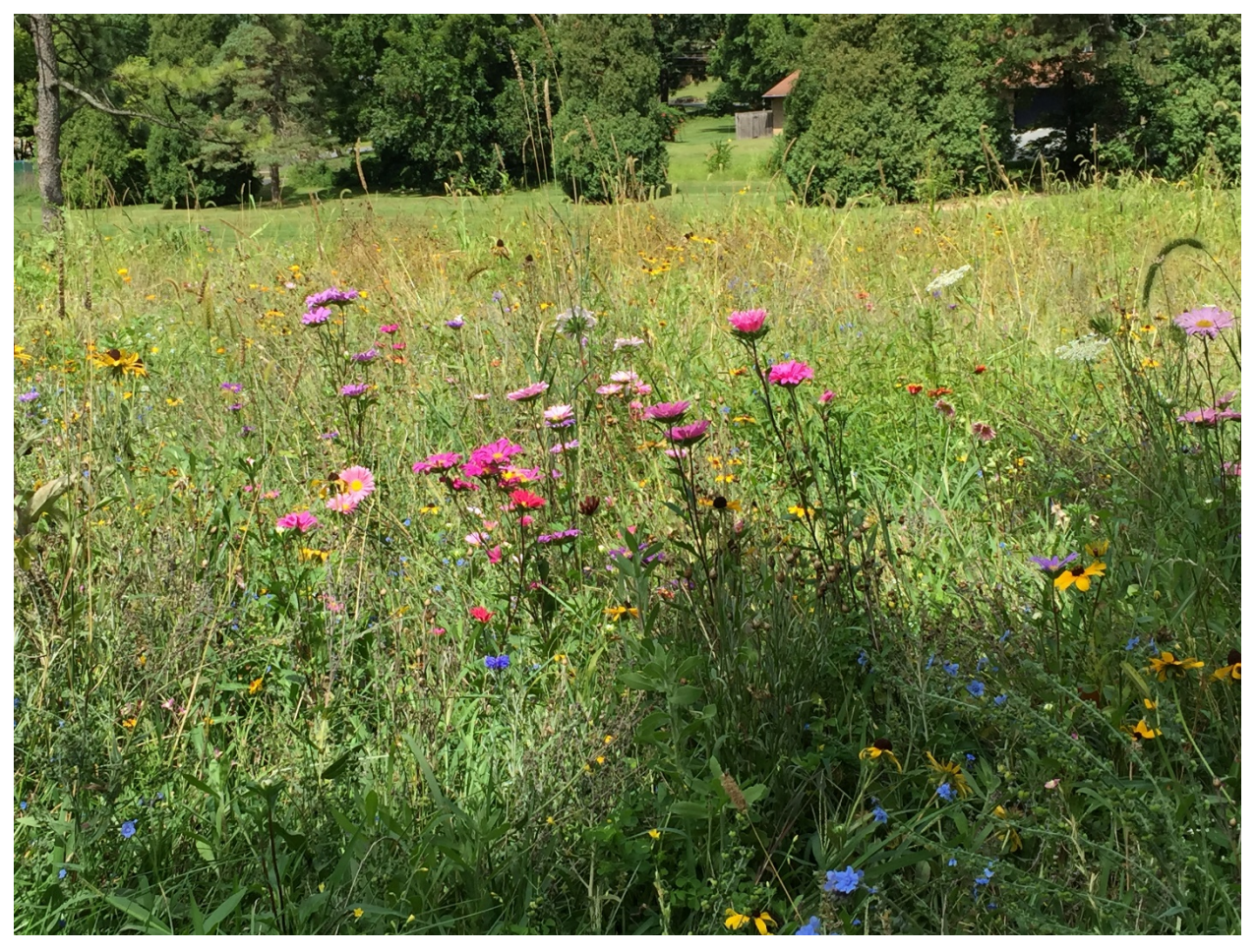
Figure 15. Out of play areas can be converted to native areas and meadows, which not only add aesthetic value to the course, but also habitat for pollinators and other wildlife.